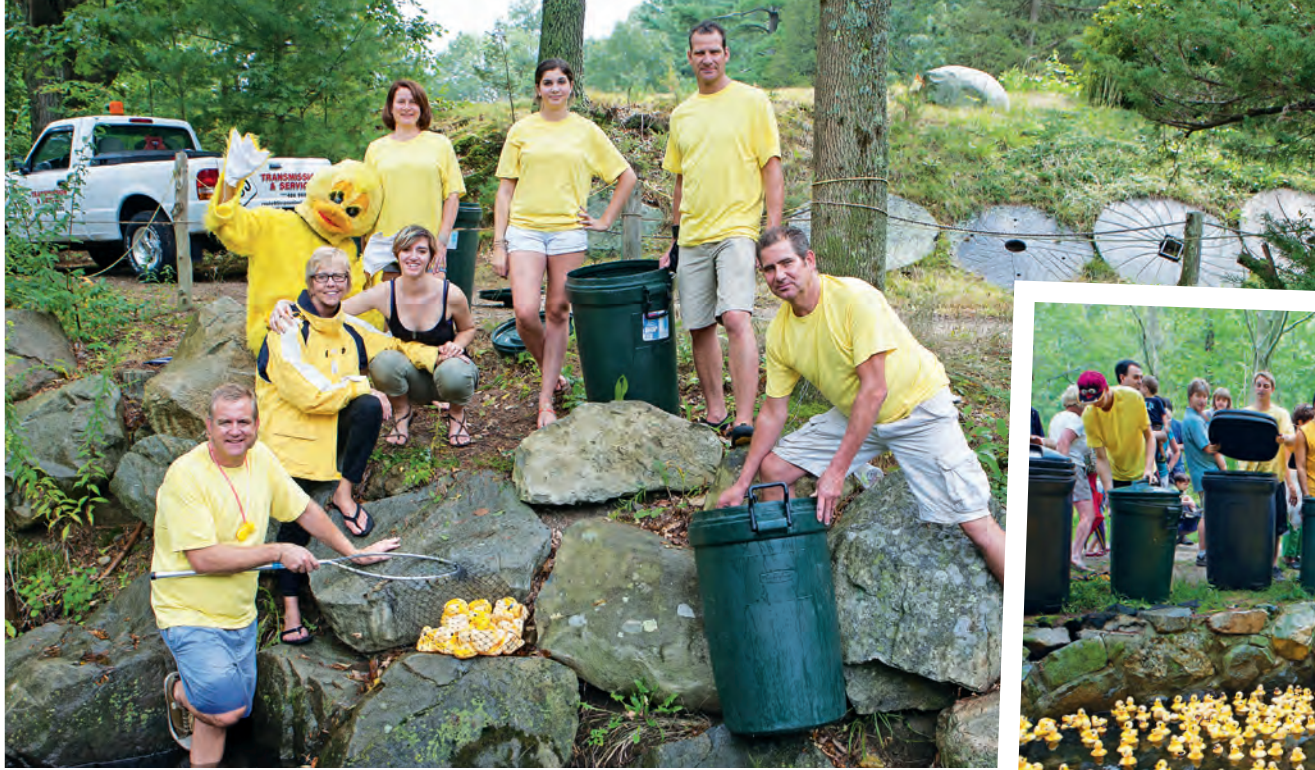
Despite the rain, supporters of Bullfinchs Duck Race participated in this annual fundraising event in September.